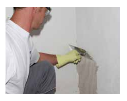
3. The adhesive is then applied to the substrate with a 8 mm notched trowel, fully covering the board area.