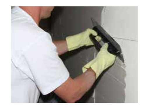
5. Afterwards, the whole area is plastered with a layer of KÖSTER Hydrosilicate Adhesive SK in a maximum thickness of 2 mm.