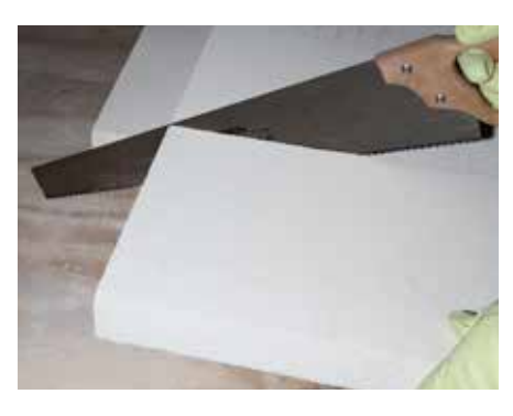
1. The KÖSTER Hydrosilicate Boards are cut using a common saw. Alternatively, the boards can be cut with a utility knife drawn along a steel edge.