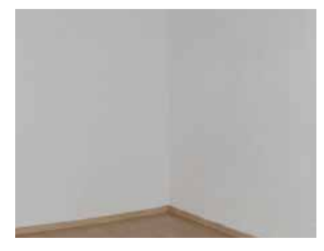
6. In normal room conditions and with good air circulation the surface can be decorated after 24 hours with breathable materials.