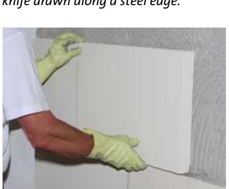
4. Next, the KÖSTER Hydrosilicate Boards are pressed onto the wall and leveled. The boards and the butted joints must be completely glued.