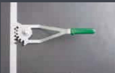
Self-engaging locking system