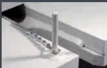
Wire or tape strapping

Absolutely safe and easy-to-operate locking system – self-engaging.