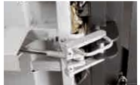
Sliding door with hydraulic door lock; additional covers optional for all three configurations.