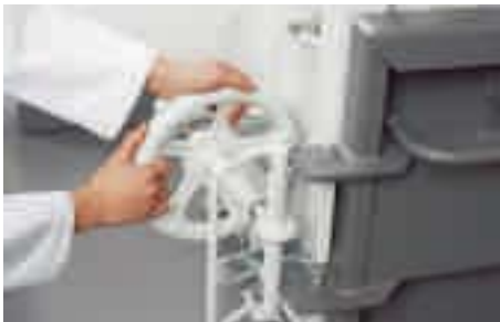
Double door with hand wheel door lock (except V-Press 504 - double door with bell-crank lever instead)