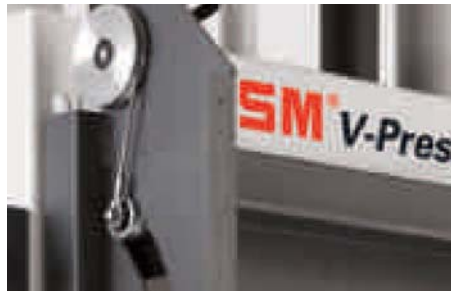
Sliding door with hand wheel door lock (except V-Press 818 plus, 820 plus and 825 plus - loading flap instead)