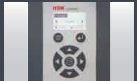
Keypad with display